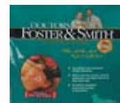
Dry Senior Dog Food