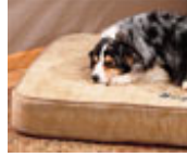
Quilted Super Deluxe Bed