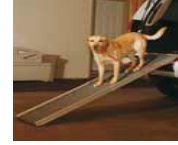
Telescoping Dog Ramp