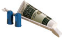
ToothCare Dental Kit

Various toothpastes, brushes, pads, and other mouth care products are available. The choice is up to you and your dog for what works best.