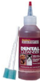
Dental Cleanser & Sponges