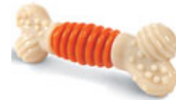
Pro Action Dental Chew