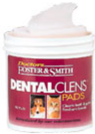
Dental Clens® Pads