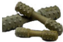
Dental Scrubbies™ Treats