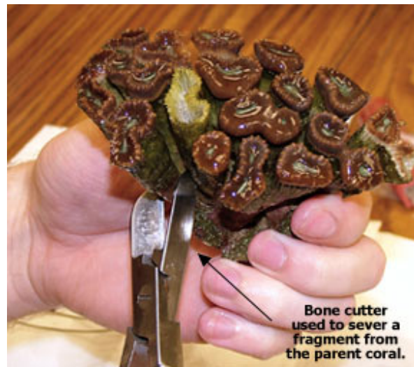
Bone cutter used to sever a fragment from the parent coral.

As reef aquariums gain popularity, the amount of knowledge regarding the husbandry of corals steadily increases, developing better and more successful techniques. However, understanding and replicating conditions that induce coral spawning is still an elusive aspect of coral care. It is still uncommon for corals to spawn in the home reef aquarium. Luckily, corals employ more than one reproductive strategy to propagate. Though sexual reproduction is yet uncommon, asexual reproduction is extremely common in a well-maintained home reef aquarium.