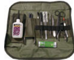
DR Instruments Deluxe Fragging Kit