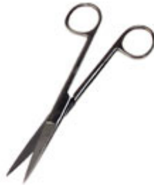
Aquatic Tissue Scissors