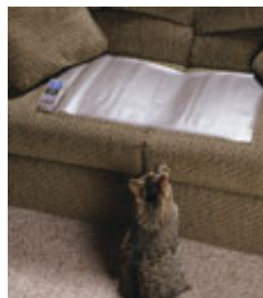
Scat Mats and Strips