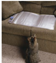
Scat Mats and Strips