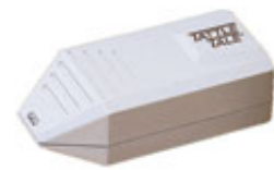
Tattle Tale Alarm