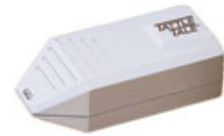
Tattle Tale Alarm