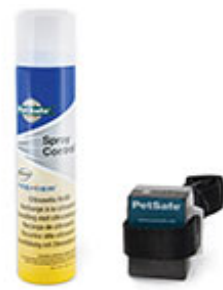
PetSafe® Anti-Bark® Spray Collar™