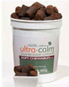
Drs. Foster & Smith Ultra-Calm® Soft Chewables