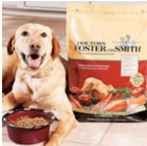
Drs. Foster & Smith Signature Series® Adult Dog Food