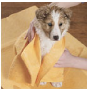
Drs. Foster & Smith Pet Towels