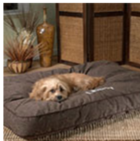
Drs. Foster & Smith Ultimate Classic Dog Bed with ScentLok® Odor Control