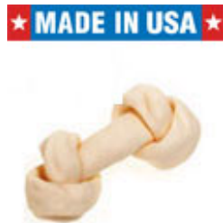
Drs. Foster & Smith Super Heavyweight Rawhide