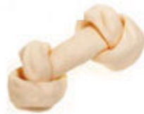
Drs. Foster & Smith Super Heavyweight Rawhide