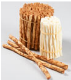
Drs. Foster & Smith Premium Rawhide Twisted Chews