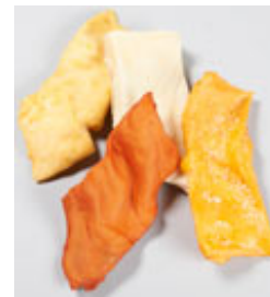
Premium Extra-Thick Rawhide Chips