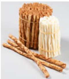
Drs. Foster & Smith Premium Rawhide Twisted Chews