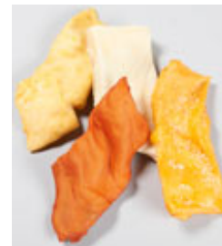
Premium Extra-Thick Rawhide Chips