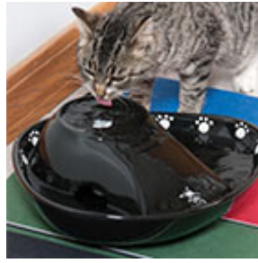
Drs. Foster & Smith Westport Ceramic Waterer and Filters