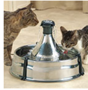
PetSafe® Drinkwell® 360 Stainless Steel Pet Fountain