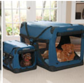
Drs. Foster & Smith Dura-Ruff® Folding Pet Den