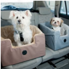
K&H Bucket Booster Pet Seat