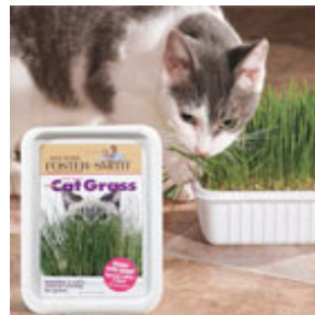
Drs. Foster & Smith Cat Grass