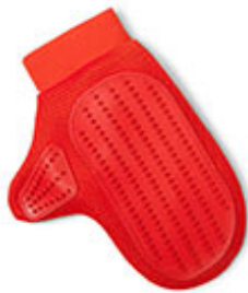
Original Love Glove