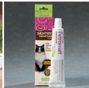
Sentry Hairball Relief & Petromalt Petroleum-Free Hairball Relief