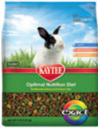
Kaytee Exact Rainbow Rabbit Diet

Sun-cured Alfalfa Meal, Wheat Middlings, Ground Oats, Soy Hulls, Ground Wheat, Ground Flaxseed, Soybean Meal, Dried Cane Molasses, Salt, Whole Cell Algae Meal(source of DHA), Fructooligosaccharide, Soy Oil, DL-Methionine, L-Lysine, mixed Tocopherols (a preservative), Yeast Extract, Dicalcium Phosphate, Yucca schidigera Extract, Vitamin A Supplement, Choline Chloride, Vitamin E Supplement, Riboflavin Supplement, Manganese Proteinates, Copper Proteinates, Copper Sulfate, Ferrous Sulfate, Zinc Oxide, Manganous Oxide, Vitamin B12 Supplement, Niacin, Calcium Pantothenate, Menadione Sodium Bisulfite Complex (source of Vitamin K activity), Rosemary Extract, Citric Acid, Cholecalciferol (source of Vitamin D3), L-Carnitine, Pyridoxine Hydrochloride, Thiamine Mononitrate, Folic Acid, Biotin, Calcium Iodate, Dried Aspergillus oryzae Fermentation Extract (source of protease), Dried Bacillus subtilis Fermentation Extract, Dried Bacillus licheniformis Fermentation Product, Dried Bacillus subtilis Fermentation Product, Cobalt Carbonate, Sodium Selenite, and Artificial Color.