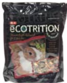
8 In 1 Ecotrition Rabbit Diet

Dehydrated Alfalfa Meal, Ground Corn, Heat Processed Soybeans, Whole Corn, Oat Groats, Barley, Sunflower Seed, Soybean Meal, Timothy Hay, Wheat Middlings, Soybean Hulls, Carrot Slices, Green Split Peas, Feeding Oatmeal, Yellow Split Peas, Diced Apples, Diced Pineapple, Cane Molasses, Salt, Diced Carrots, Diced Potatoes, Minced Onions, Parsley Flakes, Celery Flakes, Diced Red Peppers, Diced Green Peppers, Cabbage Flakes, Leek Flakes, Diced Zucchini, Tomato Fakes, Spinach Flakes, Ground Limestone, Dicalcium Phosphate, Choline Chloride, Vitamin A Acetate, D-Activated Animal Sterol, dl-Alpha Tocopheryl Acetate, Niacin, Riboflavin, Pyridoxine Hydrochloride, Thiamine Monohydrate, d-Calcium Pantothenate, Vitamin B12 Supplement, Menadione, Sodium Bisulfate Complex, Folic Acid, Biotin, Magnesium Oxide, Ferrous Carbonate, Ferrous Sulfate, Zinc Oxide, Manganous Oxide, Copper Sulfate, Calcium Iodate, Cobalt Carbonate, and Color Added : FD & C Red #40, FD & C Yellow #5, FD & C Yellow #6, FD & C Blue #1.