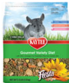
Kaytee® Fiesta Chinchilla

Sun-cured Alfalfa Meal, Whole Oats, Dehulled Soybean Meal, Ground Oats, Ground Wheat, Wheat Middlings, Ground Corn, Oat Groats, Barley, Sunflower, Wheat, Raisins, Dried Banana, Dried Papaya, Peanuts, Dehydrated Carrots, Wheat Flour, Dried Beet Pulp, Dehydrated Sweet Potato, Ground Rice, Dried Cranberry, Dicalcium Phosphate, Dehydrated Apple, Rice Flour, Soy Oil, Dried Cane Molasses, Wheat Germ Meal, Salt, DL-Methionine, Whole Cell Algae Meal (source of Omega-3 DHA), Fructooligosaccharide, Calcium Carbonate, Magnesium Oxide, Vitamin A Supplement, Choline Chloride, L-Lysine, Yeast Extract, Sesame Seed, Yucca schidigera Extract, Mixed Tocopherols (a preservative), Riboflavin Supplement, Ferrous Sulfate, Vitamin B12 Supplement, Vitamin E Supplement, Manganous Oxide, Zinc Oxide, Niacin, Potassium Chloride, L-Ascorbyl-2-Polyphosphate (source of Vitamin C), Copper Sulfate, Menadione Sodium Bisulfite Complex (source of Vitamin K activity), L-Carnitine, Rosemary Extract, Citric Acid, Cholecalciferol (source of Vitamin D3), Calcium Pantothenate, Pyridoxine Hydrochloride, Thiamine Mononitrate, Biotin, Folic Acid, Calcium Iodate, Cobalt Carbonate, Sodium Selenite, and Artificial Color.