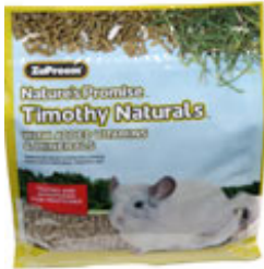
ZuPreem Nature's Promise Timothy Naturals™ Premium Adult

Sun-cured timothy hay, Soybean hulls, Dried alfalfa meal, Soybean meal, Wheat middlings, Dried molasses, Sodium bentonite, Flaxseeds, Salt, Calcium propionate, Zinc propionate, preserved with Mixed tocopherols and Citric acid, Choline chloride, DL-Methionine, Zinc sulfate, Vitamin E supplement, Dried Yucca schidigera extract, Copper sulfate, Ferrous sulfate, Manganese sulfate, Niacin, Calcium pantothenate, Vitamin A supplement, Riboflavin, Pyridoxine hydrochloride, Thiamine mononitrate, Sodium selenite, Biotin, Vitamin B12 supplement, Calcium iodate, Vitamin D3 supplement, Cobalt carbonate, Folic acid, Dried Bacillus licheniformis fermentation product, Dried Bacillus subtilis fermentation product, Copper amino acid complex, Manganese amino acid complex, Rosemary extract.