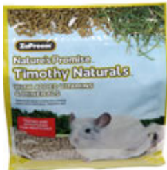
ZuPreem Nature's Promise Timothy Naturals™ Premium Adult

Sun-cured timothy hay, Soybean hulls, Dried alfalfa meal, Soybean meal, Wheat middlings, Dried molasses, Sodium bentonite, Flaxseeds, Salt, Calcium propionate, Zinc propionate, preserved with Mixed tocopherols and Citric acid, Choline chloride, DL-Methionine, Zinc sulfate, Vitamin E supplement, Dried Yucca schidigera extract, Copper sulfate, Ferrous sulfate, Manganese sulfate, Niacin, Calcium pantothenate, Vitamin A supplement, Riboflavin, Pyridoxine hydrochloride, Thiamine mononitrate, Sodium selenite, Biotin, Vitamin B12 supplement, Calcium iodate, Vitamin D3 supplement, Cobalt carbonate, Folic acid, Dried Bacillus licheniformis fermentation product, Dried Bacillus subtilis fermentation product, Copper amino acid complex, Manganese amino acid complex, Rosemary extract.