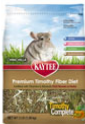
Kaytee® Timothy Complete Plus Flowers & Herbs

Sun-cured Timothy Grass Hay, Dehydrated Alfalfa Meal, Dehulled Soybean Meal, Wheat Middlings, Ground Oats, Ground Wheat, Oat Hulls, Dried Beet Pulp, Dried Cane Molasses, Fennel Seed, Caraway Seed, Dicalcium Phosphate, Dehydrated Spearmint, Wheat Germ Meal, Salt, Soy Oil, Calcium Carbonate, Dried Marigold, DL-Methionine, Vitamin A Supplement, Choline Chloride, Yucca schidigera Extract, Mixed Tocopherols (a preservative), Riboflavin Supplement, Ferrous Sulfate, Vitamin B12 Supplement, Vitamin E Supplement, Manganous Oxide, Zinc Oxide, Niacin, Copper Sulfate, Menadione Sodium Bisulfite Complex (source of Vitamin K activity), Rosemary Extract, Citric Acid, Cholecalciferol (source of Vitamin D3), Calcium Pantothenate, Pyridoxine Hydrochloride, Thiamine Mononitrate, Biotin, Folic Acid, Calcium Iodate, Dried A. oryzae Fermentation Extract (source of Protease), Dried Bacillus licheniformis Fermentation Product, Dried Bacillus subtilis Fermentation Product, Cobalt Carbonate, and Sodium Selenite.