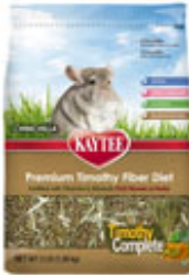
Kaytee® Timothy Complete Plus Flowers & Herbs

Sun-cured Timothy Grass Hay, Dehydrated Alfalfa Meal, Dehulled Soybean Meal, Wheat Middlings, Ground Oats, Ground Wheat, Oat Hulls, Dried Beet Pulp, Dried Cane Molasses, Fennel Seed, Caraway Seed, Dicalcium Phosphate, Dehydrated Spearmint, Wheat Germ Meal, Salt, Soy Oil, Calcium Carbonate, Dried Marigold, DL-Methionine, Vitamin A Supplement, Choline Chloride, Yucca schidigera Extract, Mixed Tocopherols (a preservative), Riboflavin Supplement, Ferrous Sulfate, Vitamin B12 Supplement, Vitamin E Supplement, Manganous Oxide, Zinc Oxide, Niacin, Copper Sulfate, Menadione Sodium Bisulfite Complex (source of Vitamin K activity), Rosemary Extract, Citric Acid, Cholecalciferol (source of Vitamin D3), Calcium Pantothenate, Pyridoxine Hydrochloride, Thiamine Mononitrate, Biotin, Folic Acid, Calcium Iodate, Dried A. oryzae Fermentation Extract (source of Protease), Dried Bacillus licheniformis Fermentation Product, Dried Bacillus subtilis Fermentation Product, Cobalt Carbonate, and Sodium Selenite.