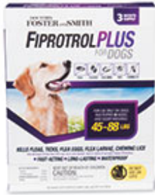
Drs. Foster & Smith Fiprotrol™ Plus Flea & Tick Control for Dogs