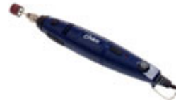
Nail Grinder Kit