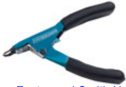
Drs. Foster and Smith Nail Trimming Kit