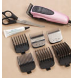
Andis 12 Pc Clipper Set with DVD