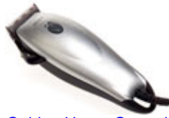
Oster Golden Home Grooming Kits