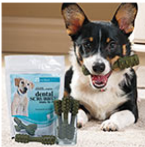
Drs. Foster & Smith Dental Scrubbies® Treats for Dogs