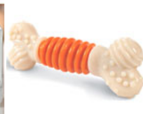
Nylabone Pro Action Dental Chew