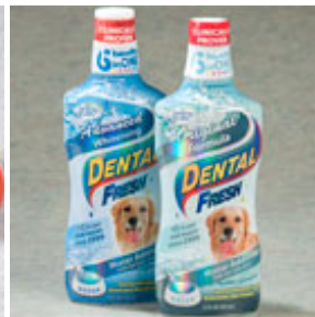
Dental Fresh Liquids