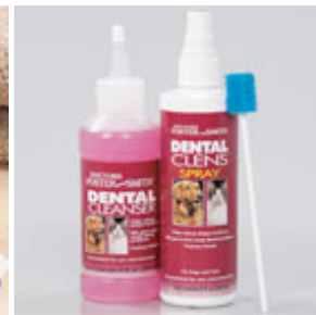
Drs. Foster & Smith Dental Cleanser & Dental Sponges