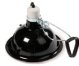
Zoo Med Deluxe Porcelain Clamp Lamp