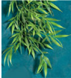
Giant Fancy Plants