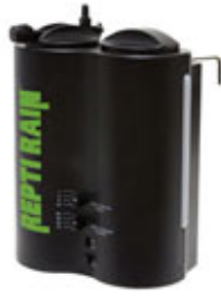
ReptiRain Automatic Misting Machine