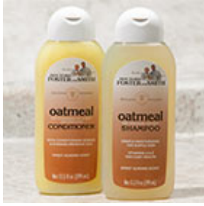
Drs. Foster & Smith Advanced Formula Oatmeal Shampoo & Conditioner