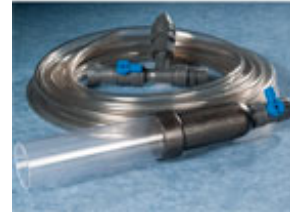
Aqueon Aquarium Water Changer