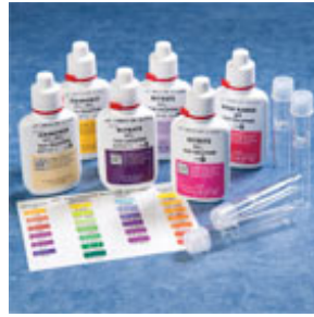
Aquarium Test Kits