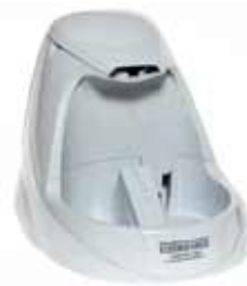
Drinkwell Platinum Cat Fountain

Removes undercoat and loose hair without cutting.