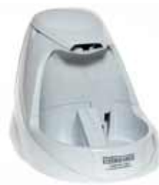
Drinkwell Platinum Cat Fountain

Removes undercoat and loose hair without cutting.