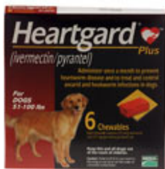
Heartgard® Plus Chewables