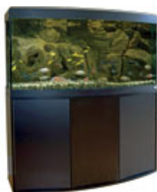
Fluval Vicenza Aquarium Kit