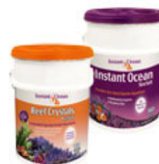
Instant Ocean & Reef Crystals