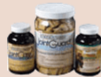
Maximum Joint Support Kit