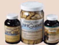
Maximum Joint Support Kit