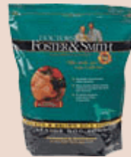
Senior Signature Series Blend Food