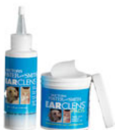
Ear Clens® Solution and Pads