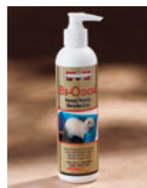
Marshall Bi-Odor Ferret Waste Deodorizer