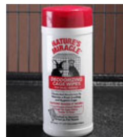
Nature's Miracle Deodorizing Cage Wipes