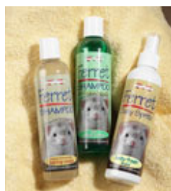
Marshall Ferret Shampoos & Spritz