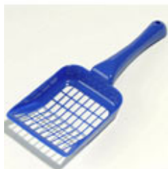
WARE Plastic Litter Scoop