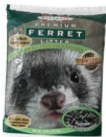
Marshall Premium Ferret Litter