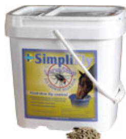
SimpliFly® with LarvaStop™ by Farnam