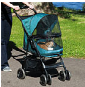
Happy Trails No-Zip Pet Stroller