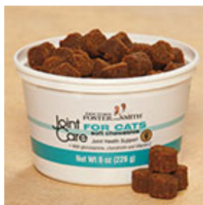
Joint Care for Cats Soft Chewables