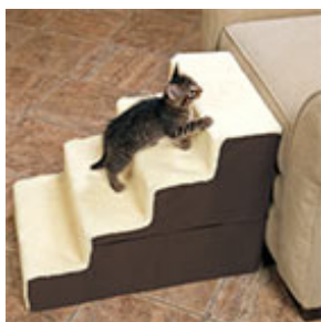
Lightweight Indoor Pet Stairs