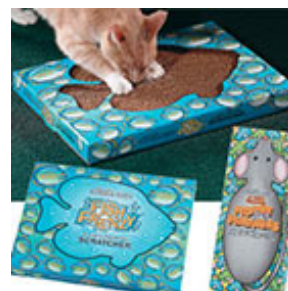
Drs. Foster & Smith Signature Cat Scratchers