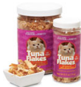
Drs. Foster & Smith Tuna Flakes