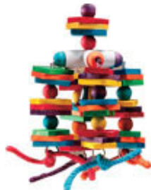
Four Way Play Activity Center