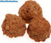
Pampered Pet Treats