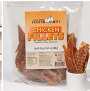
Drs. Foster & Smith Chicken Fillets Dog Treats