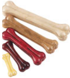
Pressed Rawhide Bones