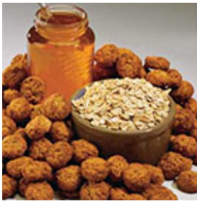
Pampered Pet Dog Treats