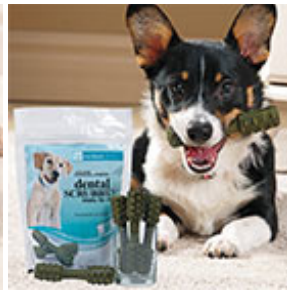
Drs. Foster & Smith Dental Scrubbies for Dogs