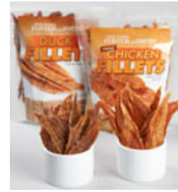
Chicken or Duck Fillets Dog Treats