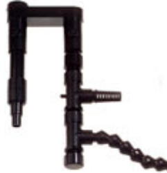
Lifegard Customflo Water System