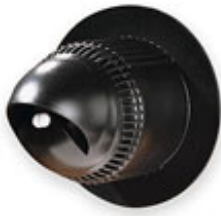
Hydor FLO Rotating Deflector