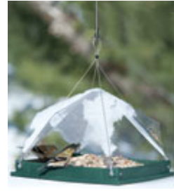
Recycled Platform Feeders