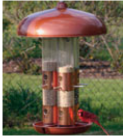
Triple Tube Wild Bird Feeder