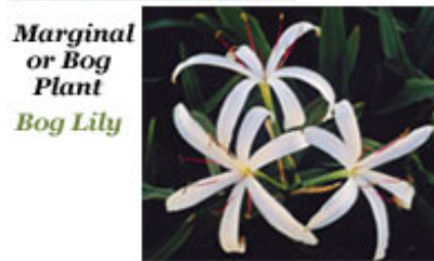
Marginal or Bog Plant Bog Lily