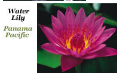
Water Lily Panama Pacific