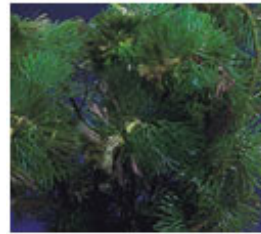
Submersed Plant Cabomba

Lilies should be planted in large or extra-large baskets . Baskets are preferable as lilies do best in good water flow. Line the container with a filter pad or sphagnum moss, and fill with planting media . Place root in pot with growing tips up and cover remaining half with additional soil. Press a 1" layer of sand or gravel on top to prevent soil from washing away and leaching into the water. Submerge the lily so that the leaves are at least 6" below the water surface. As the leaves grow to the surface of the pond, gradually lower the container until it is 12-18" below the water surface.