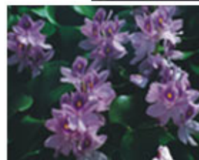
Floating Plant Water Hyacinth