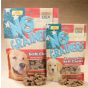
Nootie No-Grainers Soft Chew Treats