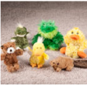
KONG Plush Toys - XSmall & Small