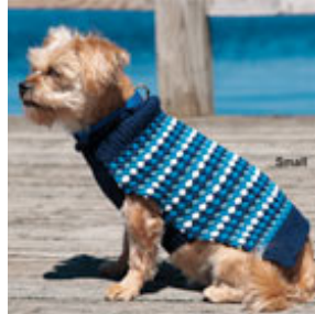
Clothing for Small Dogs