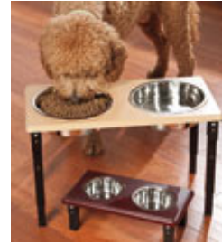
Posture Pro Elevated Diners