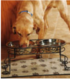
Elevated Scroll Double Feeder