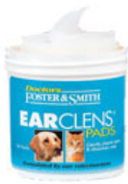
Ear Clens® Pads